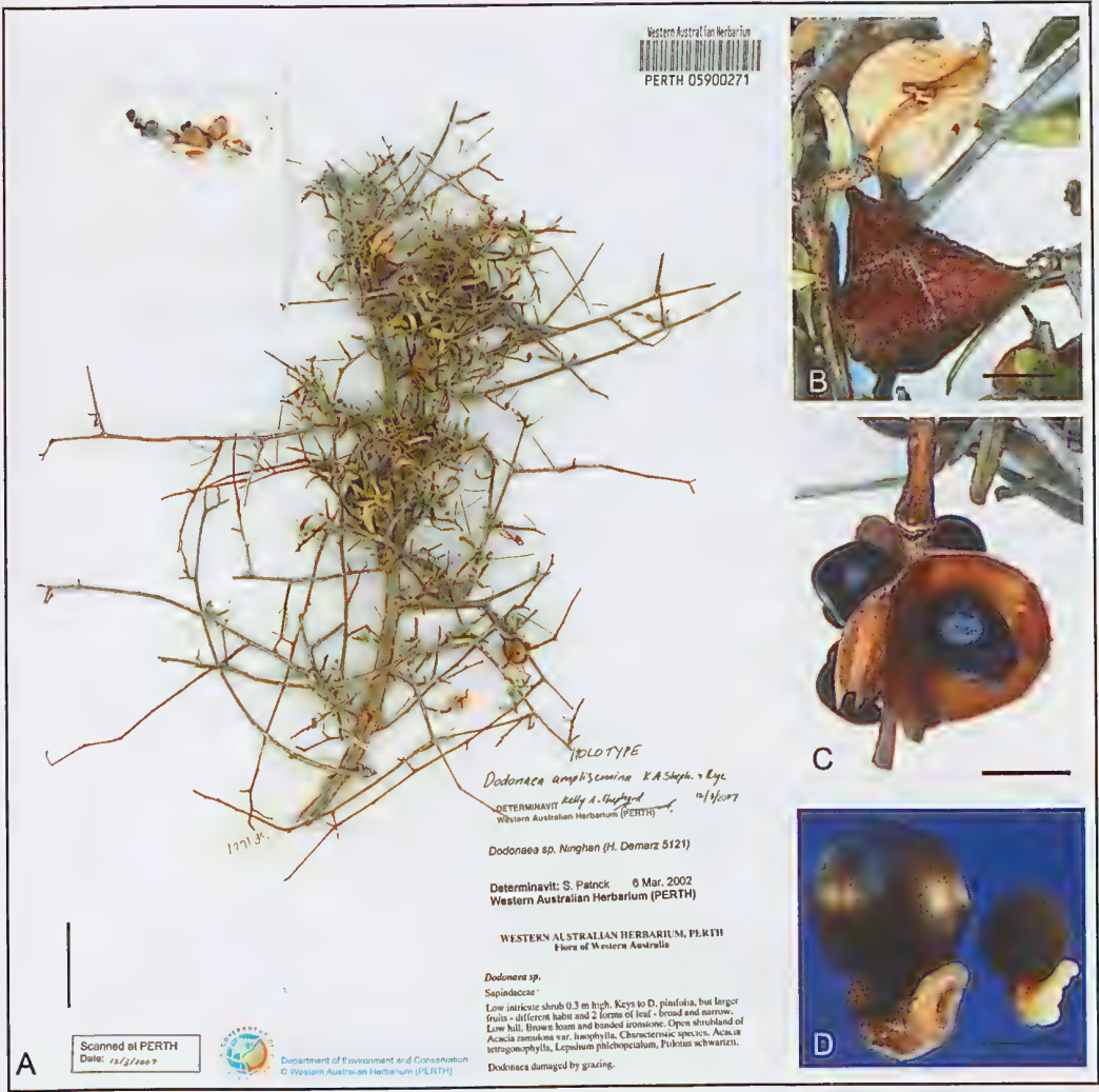
Figure 1. Dodonaea amplisemina . A – holotype (PERTH 5900271); B – fruit; C – dehiscent fruit and seeds; D – seed of D. amplisemina (PERTH 05900271) (left) and D. pinifolia (PERTH 3116441) (right). Scale bars = 3 cm (A), 3 mm (B, C) and 2 mm (D).